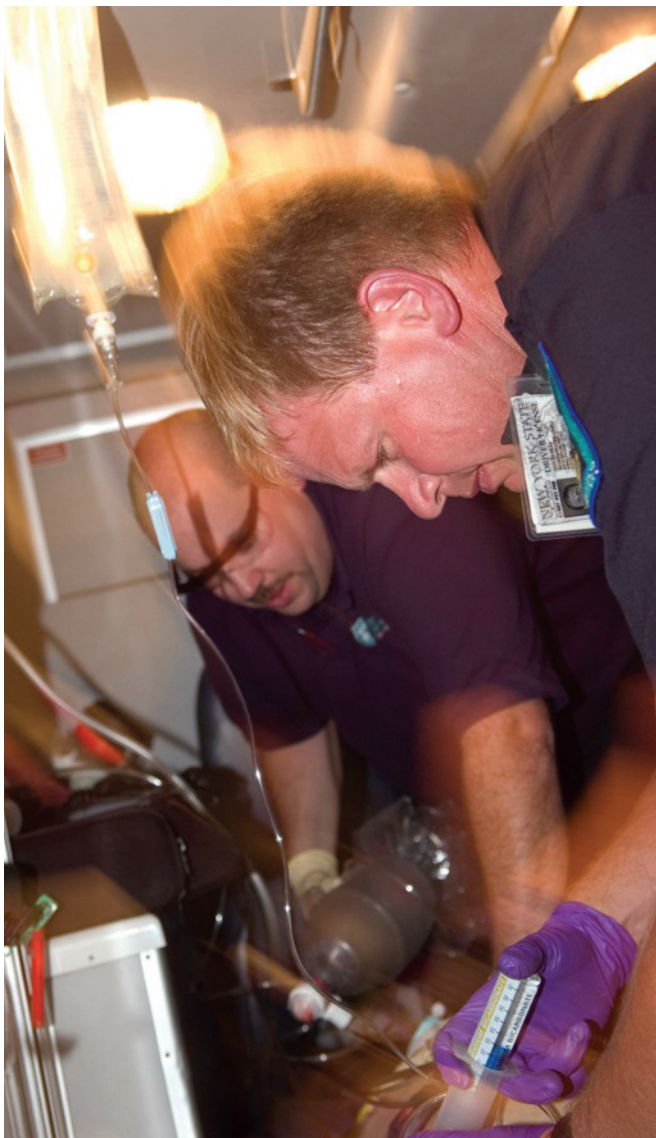
Research in resiliency training has shown successful readjustment diminishes the risk of developing posttraumatic stress disorder.

from 1990–2010, researchers reviewed 1,787 deaths of active and retired Chicago Fire Department (CFD) members, identifying 41 completed suicides. Each death was a male with an average age of 55. In addition, researchers determined the likelihood of an active or retired CFD member committing suicide was 25 times greater than the general population (10–12 suicides per 100,000 in general population versus 25 suicides/10,000 for the CFD cohort). 1 Further, work-related stress has been associated with mental health problems and the prevalence of posttraumatic stress disorder (PTSD) appears to be much higher for first responders than for the general population. Some startling data suggests that first responders live 15 years less than the “civilian world.”